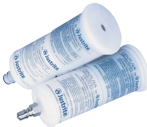
Filter minimizes odor and traps harmful vapors