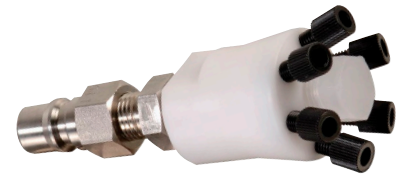
Stacker feeds multiple lines into the same can